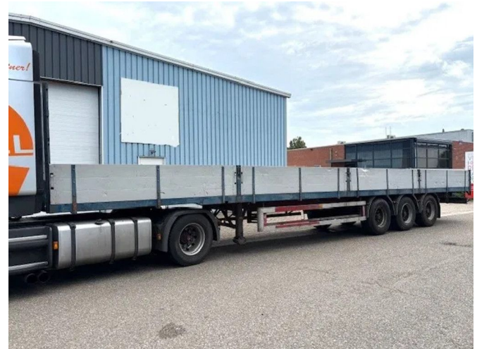
LAG 0-3-39-L 3-AXLE 13.60M. OPEN TRAILER WITH ALUM...