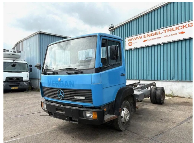
Mercedes-Benz LK 914K (6-CILINDER) FULL STEEL C... 4x2