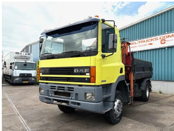
DAF 65 -180ATI 4x4 FULL STEEL 3-WAY KIPPER AND PALF...