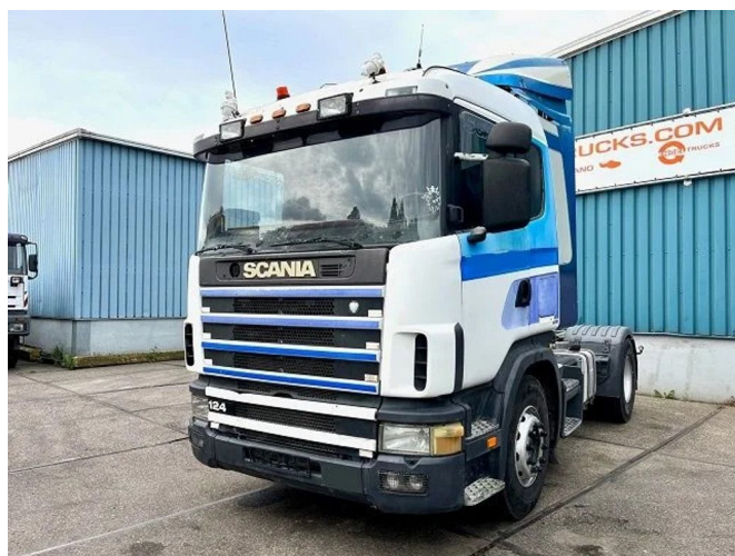
Scania R114-340 LA 4x2 (2 FUEL LINES!!) (EURO 2 / 12 GE...